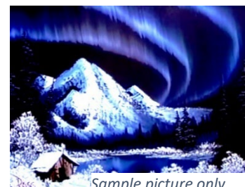
Sample picture only